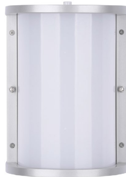
Brushed Nickel Finish & Frosted Glass Lens