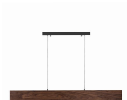
Walnut Wood Housing & Frosted Plastic Lens